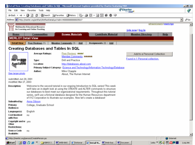
Figure 2. Detail View of Creating Databases and Tables In SQL

The resulting peer review report posted to MERLOT contains a description of the learning material and the evaluation. The description includes "learning goals, targeted student population(s), prerequisite knowledge/skills, type of learning material, summary of procedures for using the software