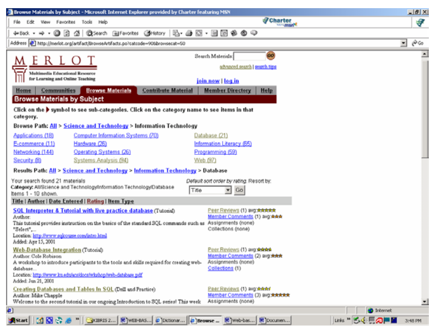
Figure 1. Entries in the Database sub/subcategory of Information Technology subcategory under Science and Technology category

The collection can be browsed by subject area, which includes Arts, Business, Education, Humanities, Mathematics, Science and Technology, and Social Sciences. The subjects are organized in a three-level hierarchy. For example, the Science and Technology category currently has over three thousand entries which are organized in eleven sub-categories including Agriculture, Information Technology, etc. The Information Technology subcategory in turn has twelve sub/subcategories, which include E-commerce, Networking, Security and others. The "browse members" link on the Browse the MERLOT Library screen allows the user to browse the MERLOT members by subject area/skill or interest. Figure 1 shows the expansion of the Database sub/subcategory under Information Technology. Two tutorials and a drill-and-practice are displayed in the partial listing. Each material has a peer review and one or more user ("Member") comments. The ratings are indicated by the number of stars on a scale of 1 to 5, 5 being the highest. Figure 2 shows Detail View of the third material Creating Databases and Tables In SQL .