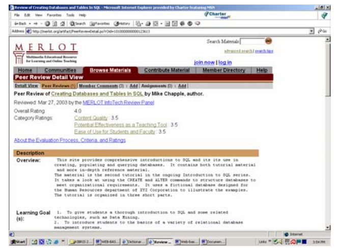
Figure 3(a). Peer Review of Creating Databases and Tables In SQL (Part a)

Individual members can submit learning materials, assignments and user comments (called Member Comments) to MERLOT. The entries in the MERLOT repository are listed with the numbers of and average ratings for Peer Reviews and Member Comments as shown in Figure 1. A sample user comment is given in Figure 4.