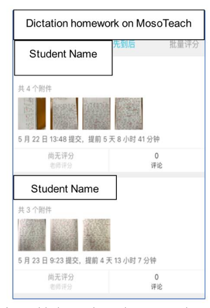
Figure 2. New types of listening exercises added to Keke and MosoTeach

With regard to speaking practice, in addition to shadowing and recording exercises, students were provided with the option to dub videos by speaking English via Keke. They were also provided with the option of recording speeches on given topics and uploading their recordings to MosoTeach. They were then asked to provide peer assessments for two students' recordings. Figure 3 illustrates these speaking exercises