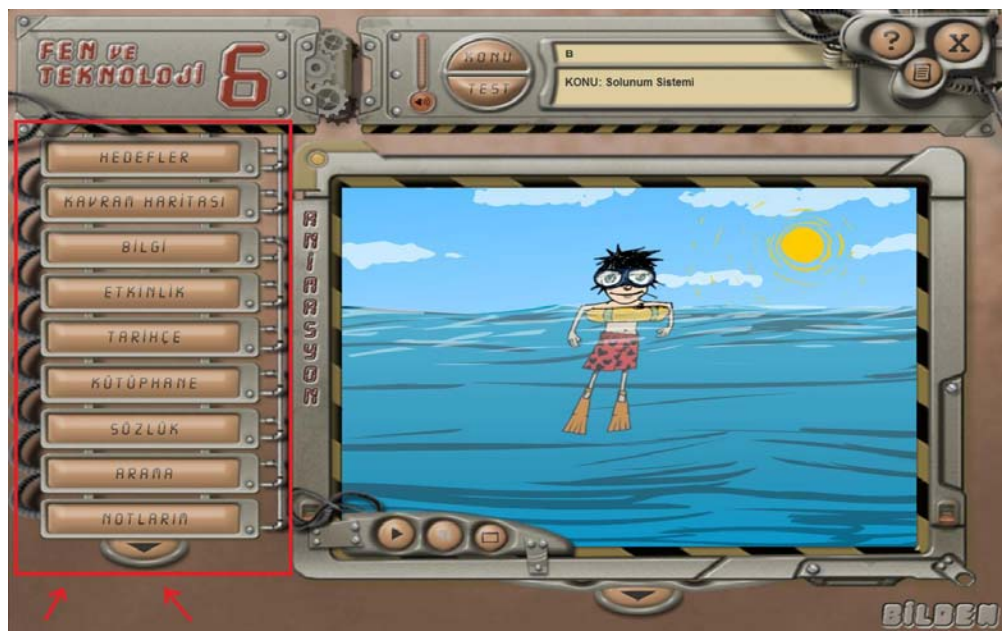
Figure 6. Bilden software screenshot – button after clicking

The graphics and animations in the Kraker software are simple and cute drawings. In this sense, the interest of the students keep alive. In Kraker software, images are weighted and software has less text than other software. In the software, different background colors and activities used on each screen enable the students to discover the software. Every activity on the software screen that is not similar to the previous screen keeps the interest of the students to the program.