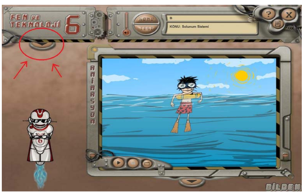
Figure 5. Bilden software screenshot – button first position

The presence of many applications dictionary, search, etc. can be considered as an important feature in terms of software density in Bilden software. But the button to which these applications take place is not recognized by some users. These situation results in the students never reaching these parts. It is important for students to be able to easily access the functions on the screenand to have these functions visible. Figure 4 shows the first position of the button and Figure 5 shows the button after clicking.