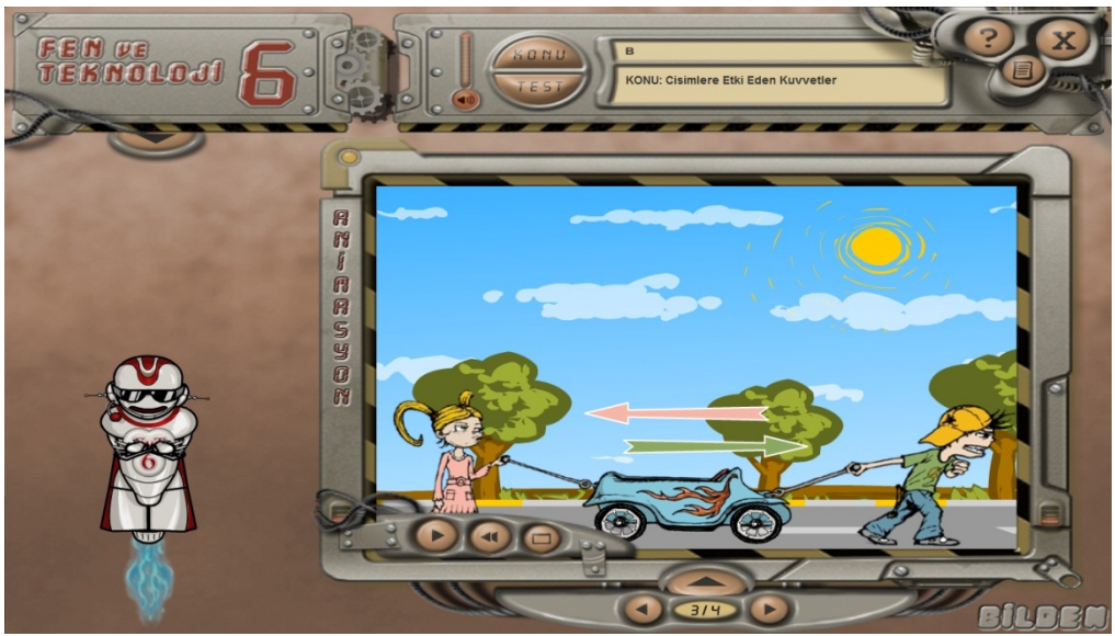
Figure 2. Bilden software screenshot