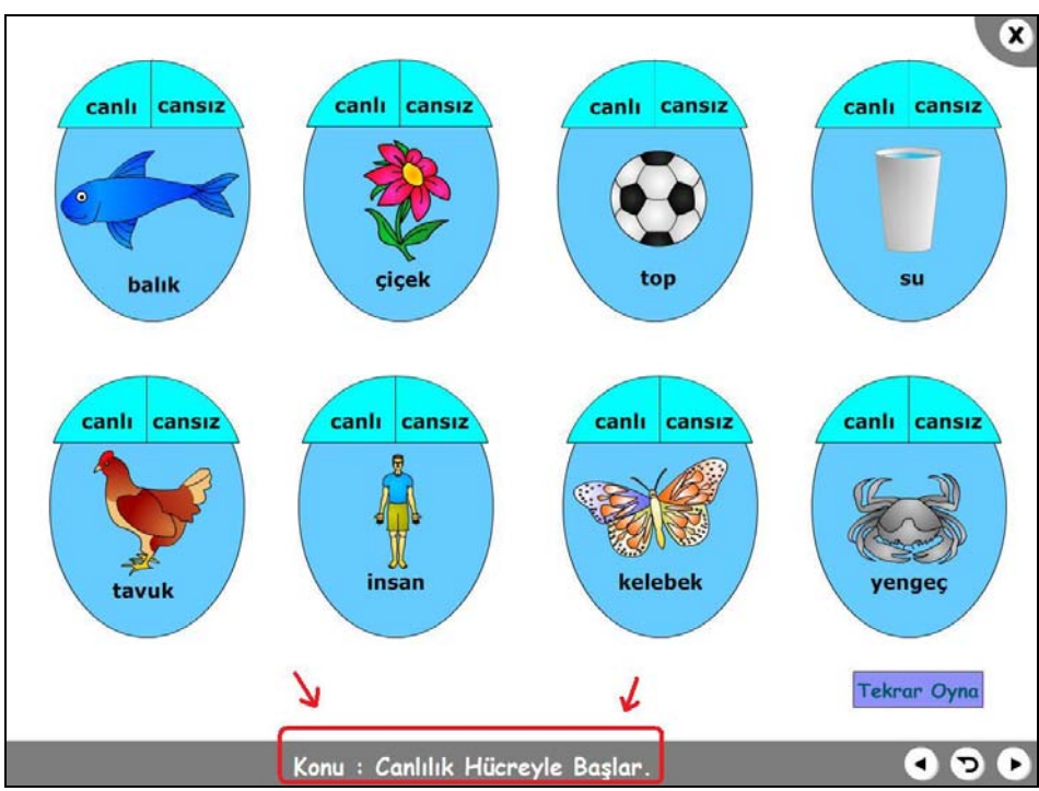
Figure 7. Kraker software screenshot – title positioned at the bottom of the screen

Titles in the Kraker software are located at the bottom of the screen. Placing the topic title at the top of the screen will allow the student to pay attention to which topic is studying. Figure 7 shows that the topic title is positioned at the bottom of the screen.