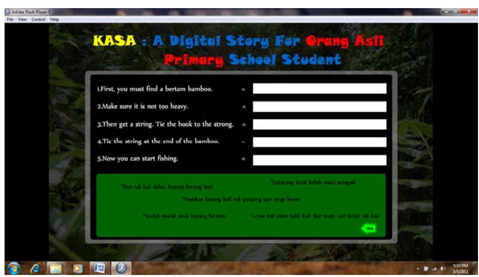
Figure 6: Screen shot of instructions for creating a bamboo fishing rod.