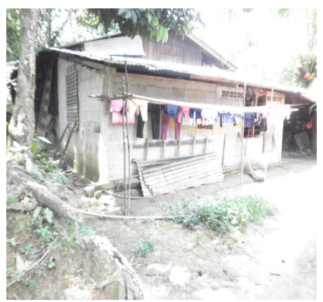
Figure 3: An Orang Asli house in the village.

Most of the students in the school were from the village nearby. It was a small village with mostly wooden houses. The houses were very close to each other and most were similar in structure. Most obvious was the kitchen section of the houses; these were built separately and could be viewed from outside. Figure 3 is an example of the house observed in the context of the study.