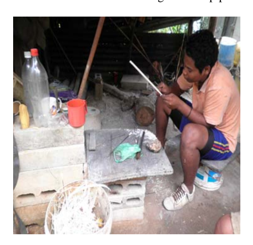
Figure 4: An Orang Asli man making a blowpipe.

Stacks of wood could be seen near the kitchen and the stove was made of bricks arranged in a triangle shape. Tapioca and rice were the staple food for the people. They also depend a lot on hunting for food. During one of the trips to the village, a group of men were seen busy at work. They were preparing the blowpipe and the quivers. When enquired, the men described how the blowpipe was made and how it was important for their hunting. Figure 4 is the scene where one of the men was making the blowpipe.