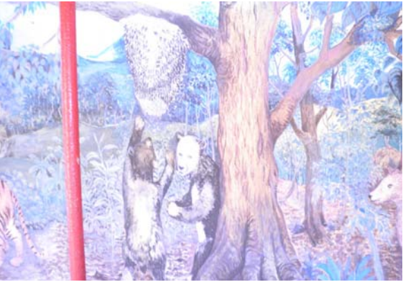
Figure 2: One of the murals in the school.

A close look at the buildings revealed that the school paid a lot of attention to the Orang Asli culture and the students' interest. The mural paintings in most of the school buildings were based on nature and environment. Images of animals such as elephants and tigers were painted on the classroom walls. Small fish ponds and manmade waterfalls were also built between the classrooms. Figure 2 is an example of mural painting on the school wall.