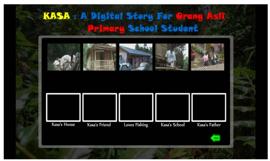
Figure 7: Screen shot of a drag-and-drop activity in the module.