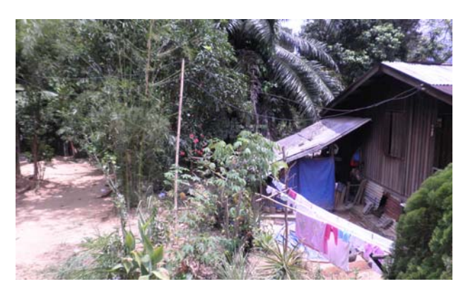
Figure 5: The village surroundings.

The village was surrounded by bamboo and rubber trees. There was also thick jungle behind some of the houses. Apart from hunting, the people also collect bamboo and rubber to be sold. Figure 5 is the scene of the surroundings of the village.