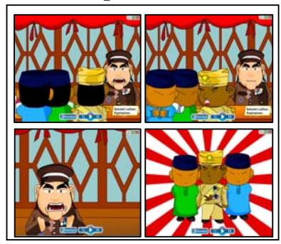
Figure 2: GN mode