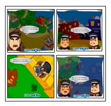
Figure 1: GT mode

The design and development of the multimedia learning material in this study incorporating Mandell & Malone TLH model of historical thinking, Mayer's (2009) cognitive theory of multimedia learning, Sweller's (2005) cognitive load theory, and Keller's (2010) motivation model. The history learning material was constructed based on the principles and guidelines derived from these models and theories. Adobe Flash CS3 was the programming tool for designing and Adobe Illustrator CS3 was used to edit some of the graphics. The animated part of the graphic novel images and text was created by Flash program. This study was conducted by developing three modes of interactive multimedia courseware, namely Graphic novel and Text (GT) mode, Graphic novel and narration (GN) mode and Graphic novel, Text and Narration (GTN) mode. Graphics (Figure 1). Graphic Novel and Narration (GN) mode provided the verbal content in the form of simultaneous audio narration with the graphics (Figure 2). Graphic Novel, Text and Narration (GTN) mode provided both audio narration and on-screen text with the graphics (Figure 3).