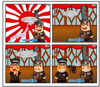
Figure 3: GTN mode