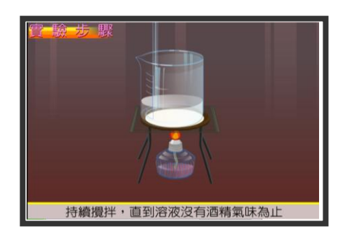
Figure 1: Images captured from the animation