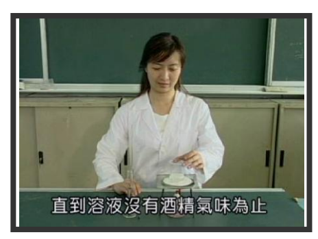
Figure 2: Images captured from the video