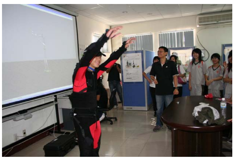
Figure 1: students visited to 3D virtual reality lab of nearby university to allow them to experience the actual process of 3D virtual reality animation filming.

In the practical part of the virtual reality course, the researcher selected Space Magician as the first step in practice. The reason was that this software is easily learned and easy to understand, and offers a humanized operation interface, specific 3D presentation of space, fast drawing, instant imaging features, easy operation, and absence of complex commands. This program is therefore easy for beginners to learn to use. Additionally, with regard to teaching facilities, because this course involves learning to use related graphics software, higher-end computer facilities are needed, preferably with high capacity memory and separate display chips. With regard to the input/output devices required for the course, high schools that wish to teach this course can, funds permitting, purchase input devices such as lower-priced optical data glove, shutter glasses or head-mounted displays (HMDs) for teaching purposes. Moreover, through school strategic alliances, high schools may also be able to use mid-range and high-end equipment in virtual reality lab of university, allowing students to experience the actual process of 3D virtual reality animation filming such as "motion capture mirrors emotions" how to work, is shown in Figure 1.