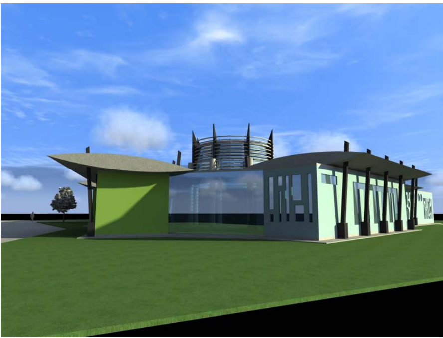
Figure 3: Product 3