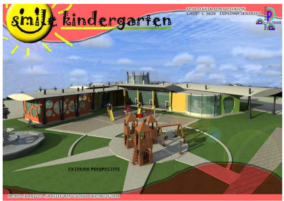
Figure 1: Product 1

From this research, the integration of mobile technology and CAD technology help the students to produce quality product of architectural works. The final students' products from the treatment groups had its own identities. The products from the treatment group also show qualities of creatives products based on CPAM model. Some samples from the students' products are shown in the figures below.