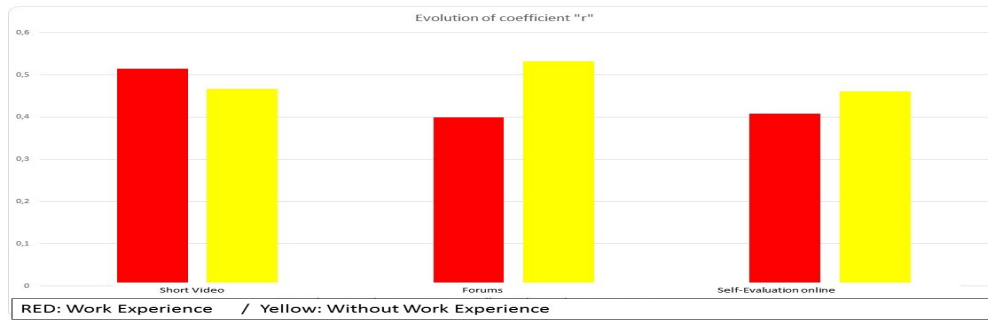
Figure 4. Coefficient of linear correlation considering the variable “Work Experience”