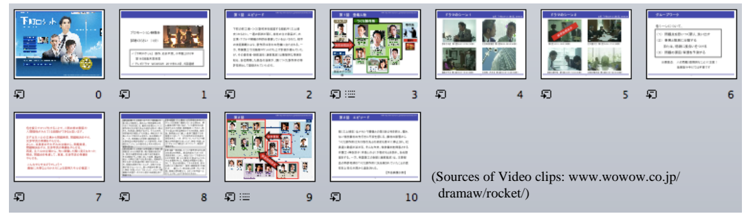
Fig. 8. Negotiation Practicum Enhanced with Video and Synopses.

In order for the negotiation contents to be the reflection of the real-life situation, a non-fiction novel was adopted. Further, we employed the novel's dramatized video or movie. From the novel, excerpts relevant to the negotiation are prepared. Refer to the slide number 8 in Fig. 8 below. And further, the video clips corresponding to the excerpts are prepared. Refer to the slide numbers 4 and 5 in Fig. 8. In addition, to provide the students with background information for the video clips, synopses for the video clips are also prepared. Refer to the slide numbers 2 and 10 in Fig. 8.