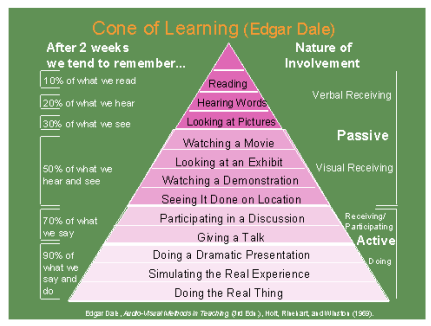
Fig. 1. Edger Dale's Cone of Learning

In the course of such incorporation, trust building through communication is fostered through negotiation practicum including exercises in groups. In such a course, the simulation experience with role modeling is crucially employed. The rationale behind this is that the simulation of the real experience will have extremely high learning outcome, as Edger Dale claims. See Fig. I for Edger Dale's Cone of Learning.