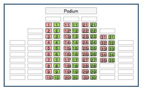
Fig. 4. Layout for One to One Negotiation Session:

in red Group B, in green. Each block represents 4 to 5