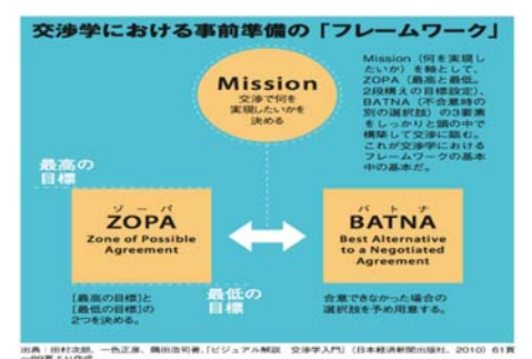
Fig. 2. The Framework for Negotiation. From: J. Tamura,

et. al. (2010). "Visual Explanation: An Introduction to Negotiation", Nihon Keizai Shinbun.