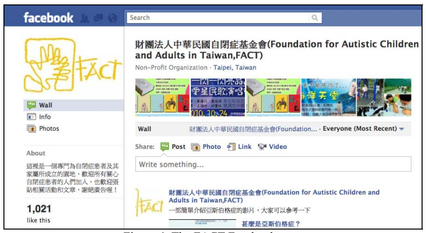
Figure 4: The FACT Facebook page

Dynamic interaction addresses on the importance of increasing interactions between the organizations, professionals, and adults with ASD. For example, the FACT and HYVH have to find possible solutions to develop viable human resource arrangement for non-working time in the interdependent homes since it is a home-based long-term care model for adults with ASD and their parents. Therefore, dynamic interactions are highly recommended and technology can play a crucial role to facilitate better interactions between the organizations and these family members. For example, the immediate communications via Web 2.0 technology (e.g., Facebook, Plurk, Twitter, Google+) are advised to increate the dynamic interaction. Figure 4 demonstrates that the FACT has begun to use Facebook to interact with individuals with ASD and families who have children or adults with ASD.