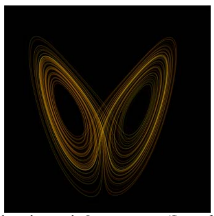
Figure 2: An icon of chaos theory - the Lorenz attractor

Theories are constructed in order to explain, predict and master phenomena (e.g. relationships, events, or behavior) to make generalizations about observations and to consist of an interrelated, coherent set of ideas and models. Complexity theory has been pervasively applied in a variety of professions to adapt to multiple environmental changes and multidisciplinary collaboration in recently research (Paley, 2007). Evolved from Chaos theory and the idea of Lorenz attractor (Figure 2), complexity theory which emphasizes uncertainty and randomness constructs a non-linear dynamic system that traditional organizational theories are inability to explain and predict. In the healthcare- and education-related literatures, there is a growing attention in complexity theory and its implications. For example, there are a variety of research and professions that employ complexity theory as the theoretical framework in their studies, such as medical education (Fraser & Greenhalgh, 2001; Rees & Richards, 2004), health promotion (Wilson & Holt, 2001), shared care for patients with long-term mental illness (Byng & Jones, 2004), and healthcare management (Plsek and Wilson, 2001).